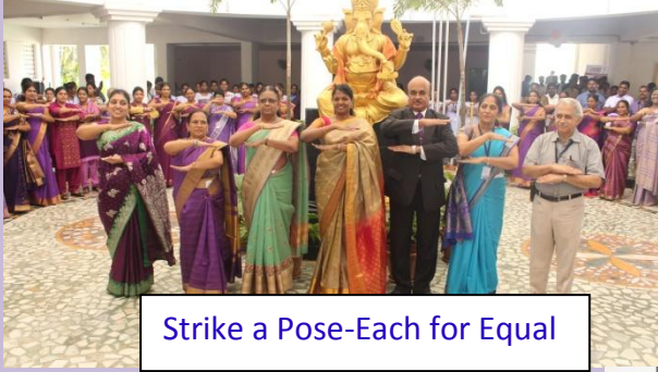
Strike a Pose-Each for Equal