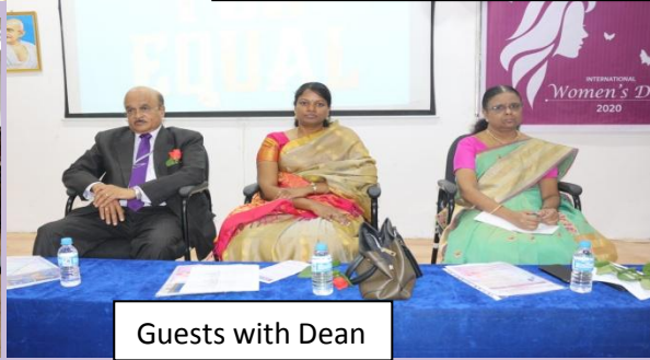
Guests with Dean