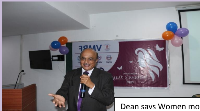
Dean says Women more than Men