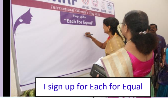
I sign up for Each for Equal