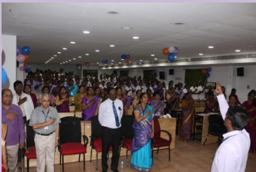
Audience taking part in Solidarity Pledge