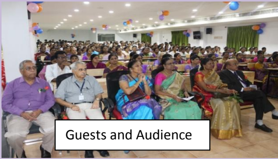
Guests and Audience