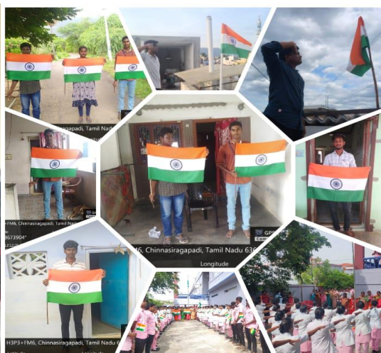
National flag-Every Home Awareness Programme