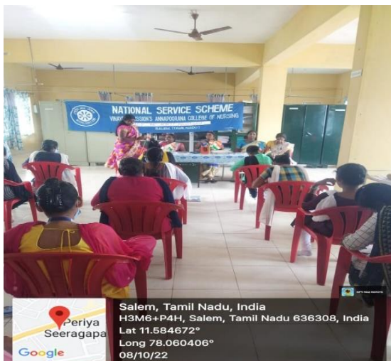
Essay Writing Competition